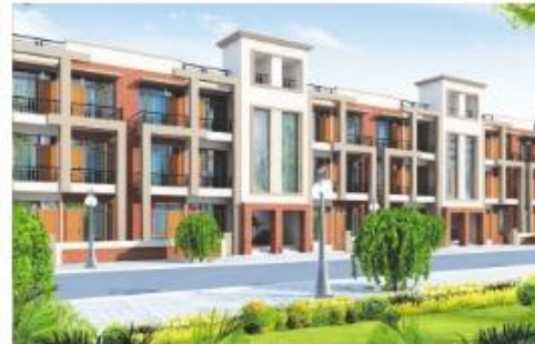
Platinum Homes, TDI City, Sector 118, Mohali