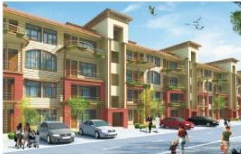
Cozy Homes-2, Sector 116, Mohali