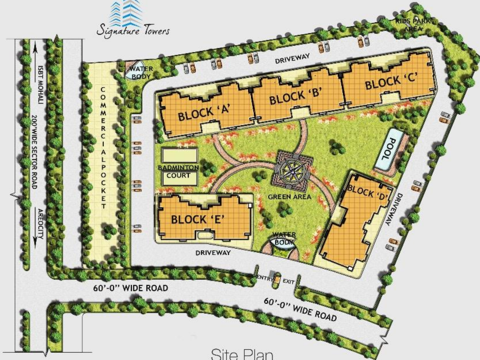
Site Plan Site Area - 3.25 Acres