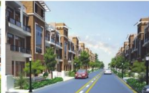
(Proposed) Signature Homes-II, Pearl's City, Sector 99, Mohali