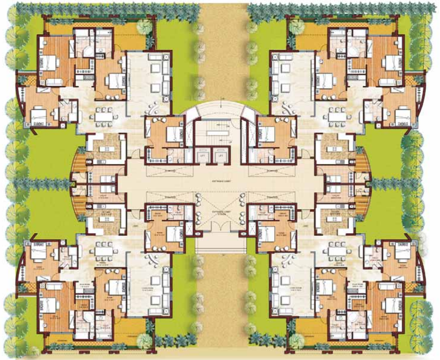
TYPE B GROUND FLOOR PLAN 4 BEDROOM + Utility SALEABLE AREA = 3520 sq.ft.